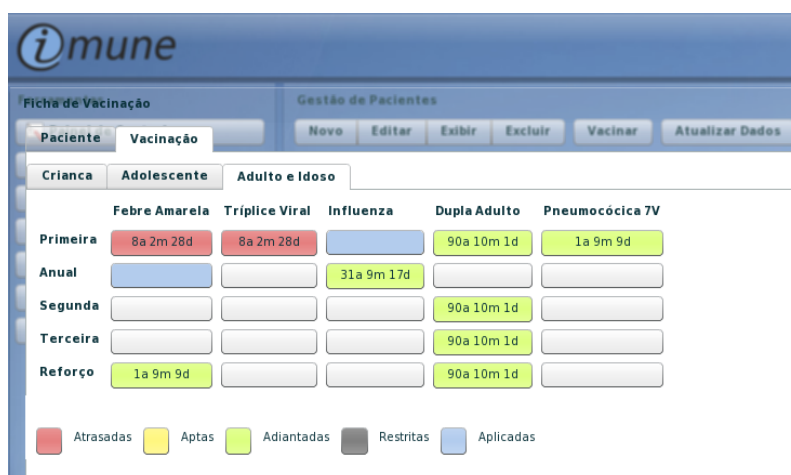
Figure 2. Vaccination history

Another module, vaccine module, provides the registry for the different kinds of existing vaccines. For each kind of vaccine specific information is recorded by the vaccine module, which also provides the vaccination history of each patient in the system. In the vaccination history is included all vaccines taken by a given patient, as illustrated in the figure 2.